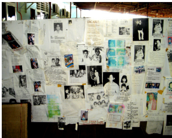
Figure 2: A board showing photos of missing people from Indonesia

Although countries in South-Eastern Asia delayed plans to ease mobility restrictions owing to the COVID-19 pandemic, 6 people continued to hazard dangerous migration across international borders by land or sea in search of safety and better economic opportunities. In 2021, MMP documented the deaths and disappearances of 77 people along migratory routes in this subregion, with the peak being recorded in December (63). The second half of 2021 saw the death of Rohingya migrating en route to South-Eastern Asian countries and witnessed a significant increase in deaths during migration in Thailand and Malaysia compared to late 2020 and early 2021. On land routes, at least 14 lives were lost during migration to Thailand, in comparison to one being recorded in the first half of 2021 and none in the second half of 2020. Six of them came from Myanmar and eight were from Cambodia, and six women, six men and two children were among the dead. All were killed in car accidents, which is the most recorded cause of death for people migrating to Thailand by land since 2014. Although Thailand has the highest rates of vehicle-related deaths in South-Eastern Asia and among the highest in the world, 7 people migrating irregularly may be at more risk due to riding in overloaded vehicles and/or drivers trying to circumvent the authorities.