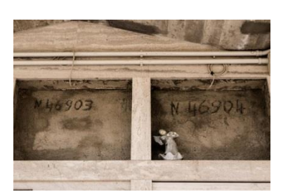
Photo 3 Graves of two migrants who lost their lives on 19<sup>th</sup> of August 2006. Piano Gatta cemetery, Agrigento, Sicily.

In the case of the 2013 shipwrecks, the Commissioner's office addressed this issue by engaging with different organisations at a national and international levels, including the Italian Red Cross, the ICRC, the International Organization for Migration, Borderline-Europe, the Comitato 3 Ottobre and diaspora communities of Eritreans across Europe. The international organisations and NGOs were asked to put together lists of families who might have lost someone in these incidents. Meetings were set up with those who were able to travel to Italy, mainly Eritreans living in European countries. In those meetings, also attended by psychologists and forensic experts from Labanof, efforts were made to establish the identities of the bodies. This allowed for identification of 19 bodies. Some of the actors involved perceived this as a procedure that was satisfying some of the families' needs as they were able to talk about the shipwreck, the loss and the identification before proceeding with the actual identification (IT#18). Including families in the process of identification means acknowledging families' position in this tragedy, as well as facilitating