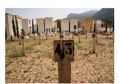
Photo 1 Grave of an unidentified victim of the 18th of April 2015 shipwreck. Castellammare del Golfo, Sicily.

Based on these key challenges, the report suggests an expansion of the role of the Special Commissioner for Missing Persons<sup>2</sup> and the good practice it has put into place, as well as exploiting further funding opportunities, in order to provide the needed resources for effective investigation. A central need is to systematically use opportunities for gathering data that are currently under-utilised, such as the collection of personal effects and survivors' testimony. Most importantly, families should be included at the centre of the investigation. Another crucial element identified in this project is the need for families to