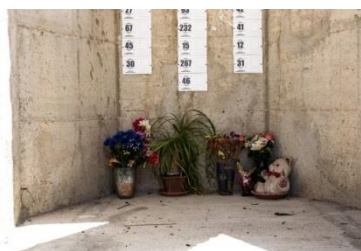
Photo 2 Piano Gatta cemetery, Agrigento, Sicily.

The thing is that there is no real division of roles. We [the Police] and the Carabinieri are Judiciary Police officers and work on investigating and reporting crimes, coordinated by the Public Prosecutor's office. Then, luckily, in Italy there's a (silent) kind of division of duties. So Carabinieri are a police force with a general competence, just like us, but, for example, in the branch of immigration in practical terms we are alone as regards the management of residence permits, photographic documentation for identification purposes and the management of immigration flows. (IT#24).