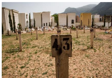
Photo 1 Grave of an unidentified victim of the 18th of April 2015 shipwreck. Castellammare del Golfo, Sicily.

The report is based on 27 semi-structured interviews with representatives from local and national authorities, civil society organisations and individuals. Some key challenges faced by the actors involved in the investigation of migrant deaths have been identified. One of these challenges is the complex nature of the problem. Migrant fatalities represent a complex humanitarian issue that requires an ongoing and coherent response, coordinated among the actors involved. They are a transnational phenomenon and as such there is a need to liaise with a range of actors in different countries. Families of the missing and dead in countries of origin and other European states or elsewhere have to be contacted in order to facilitate identification, as well as to ensure that affected families are at the centre of efforts to address the issue. Similarly, cooperation with consular or diplomatic authorities, international organisations and diaspora communities in third countries are needed to make contact with families.