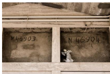
Photo 3 Graves of two migrants who lost their lives on 19 th of August 2006. Piano Gatta cemetery, Agrigento, Sicily.

In the case of the 2013 shipwrecks, the Commissioner's office addressed this issue by engaging with different organisations at a national and international levels, including the Italian Red Cross, the ICRC, the International Organization for Migration, Borderline-Europe, the Comitato 3 Ottobre and diaspora communities of Eritreans across Europe. The international organisations and NGOs were asked to put together lists of families who might have lost someone in these incidents. Meetings were set up with those who were able to travel to Italy, mainly Eritreans living in European countries. In those meetings, also attended by psychologists and forensic experts from Labanof, efforts were made to establish the identities of the bodies. This allowed for identification of 19 bodies. Some of the actors involved perceived this as a procedure that was satisfying some of the families' needs as they were able to talk about the shipwreck, the loss and the identification before proceeding with the actual identification (IT#18). Including families in the process of identification means acknowledging families' position in this tragedy, as well as facilitating